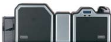
Lamination option and dual-sided printer/encoder