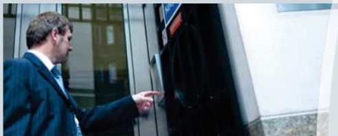
Door opening at the touch of a button

At the core of this system is the compact Intercom Server GE 50 with 2 integral outputs (door release relays) to open barriers, gates or doors and an EE 401 Master Station. Using this package, you then add a mix of surface or flush mount intercom stations, further outputs and an optional telephone transfer facility to suit the solution needed. Pre-programmed before being sent out to site, these sets are ready to install.